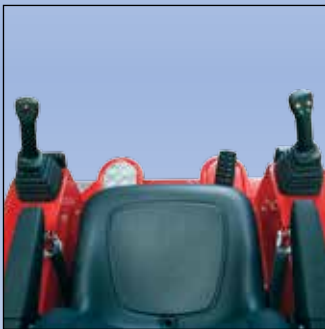
Pro operator seat