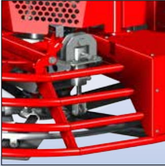
Hydraulic pitch control ??????????????????