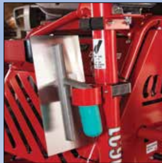
Hand trowel area Each pitch has high adjustable hand trowel holder.