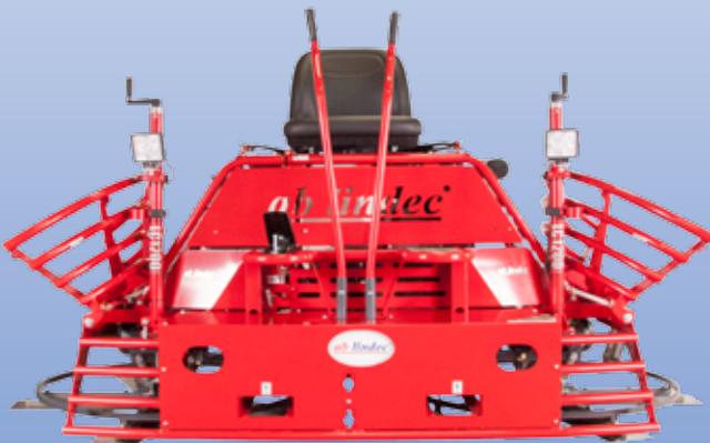
Service and freight friendly Flip up guard rings – for cheaper freight (227 cm) and easy blade swops.